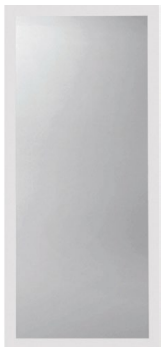
100 SERIES Full View