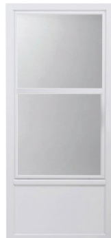
120 SERIES 3/4 Lite, Self-Storing with FlexScreen®