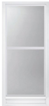
108 SERIES Full View, Self-Storing with FlexScreen®