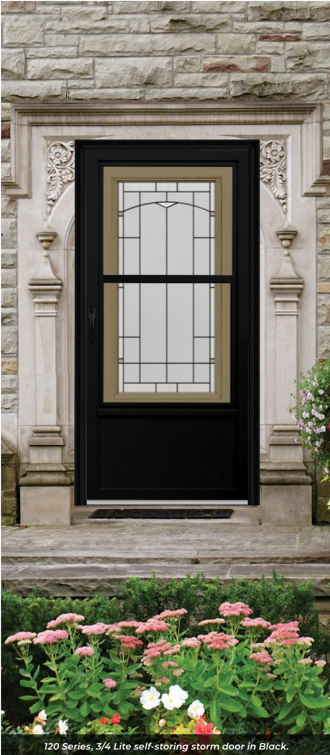
120 Series, 3/4 Lite self-storing storm door in Black.

The nested hinge provides strength where it's needed most. As the door frame carries the weight, the hinges are not pulled from the door during operation.