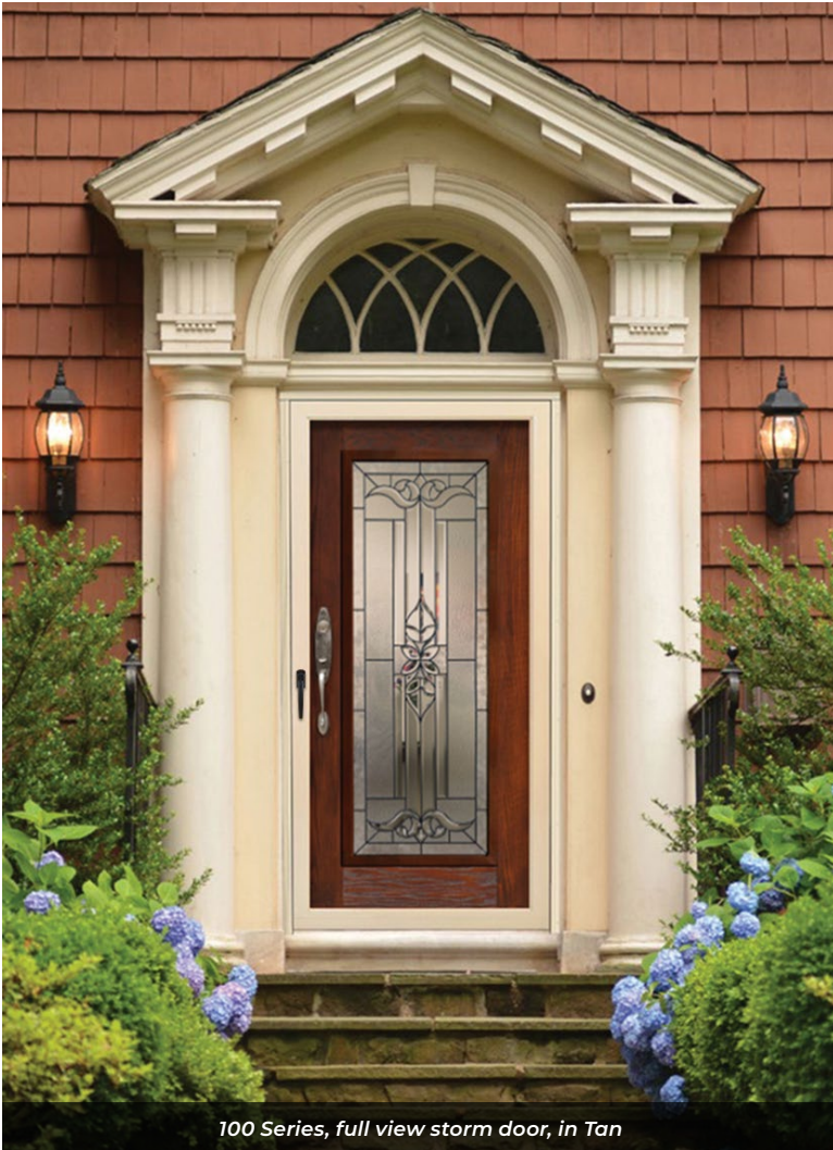
100 Series, full view storm door, in Tan