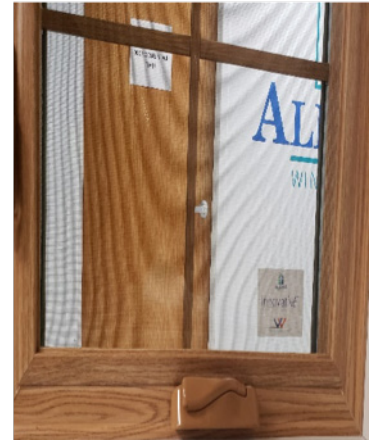
Insert screen, spring loaded at the bottom by operator.