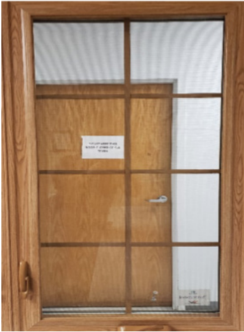
New Casement Screen No Clips