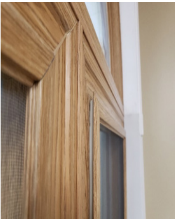
Top of screen should be flexing toward the interior.