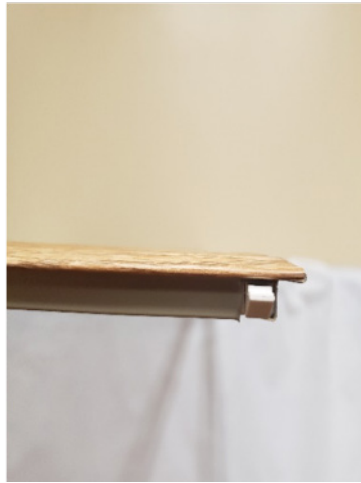
Spring loaded bottom corners